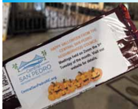
Spreading the word about CeSPNC!