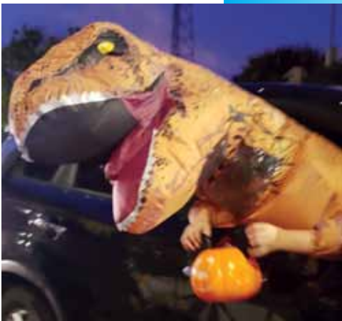
A fearsome predator looks for a sweet treat!