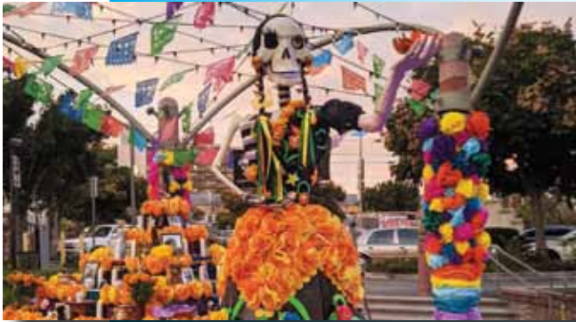
Dia de Los Muertos is celebrated with artistic style by LA CALACA BLANCA