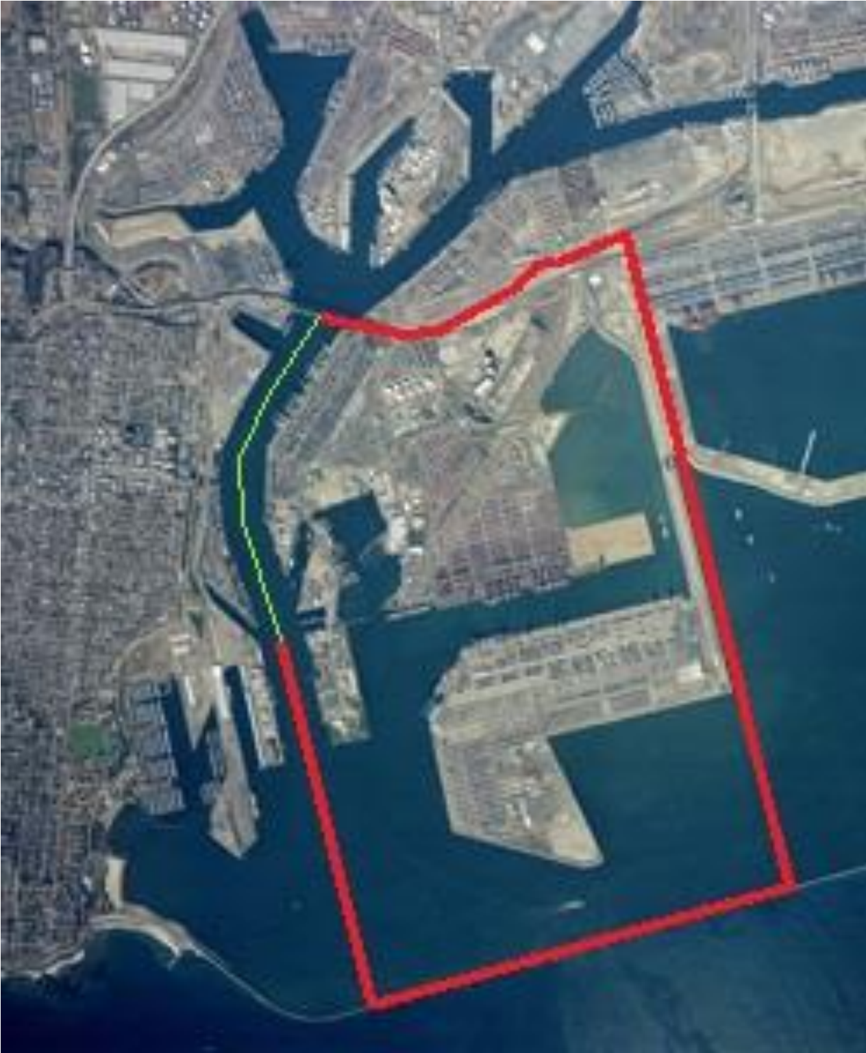
Attachment A – Map of the Area concerned by the boundary adjustment